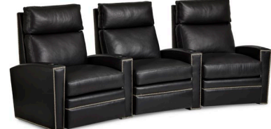
Acclaim - 2202 series Choose outside arms