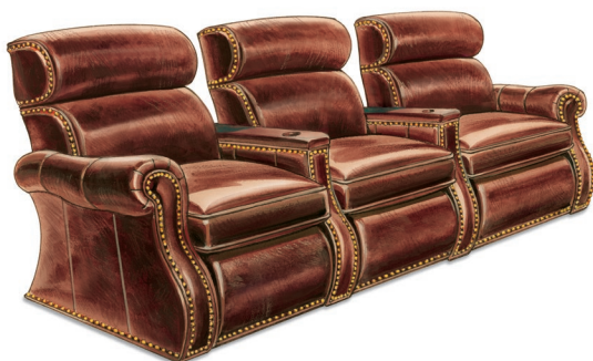
Illustration above as shown from left to right: