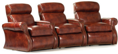
Monterey - 2200 series Choose outside arms