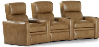
Savoy - 2201 series Choose outside arms